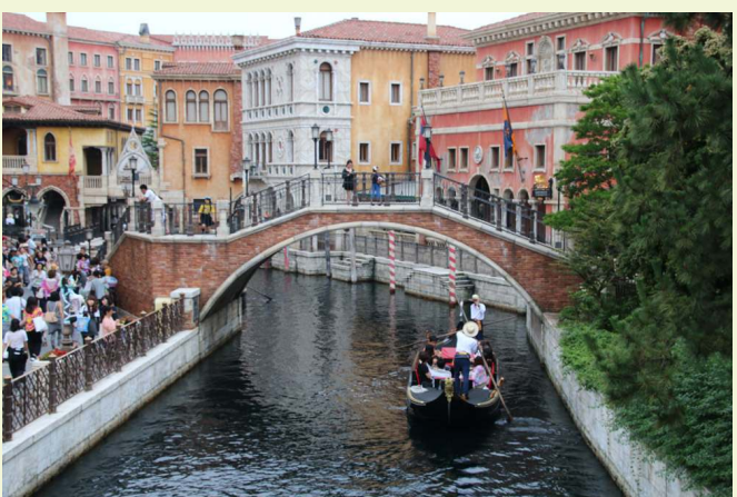
右上 高一史曾晨芸(石門之美) 左下 高一史陳姿佑(日本風光)